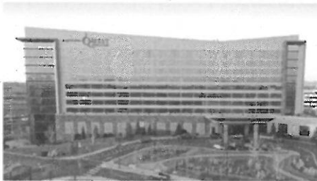
Spokane - March 2nd